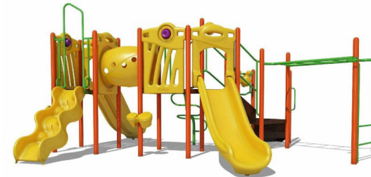
(Actual equipment shown)